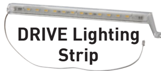
DRIVE Lighting Strip