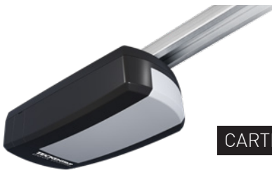
CARTECK MOTOR L60