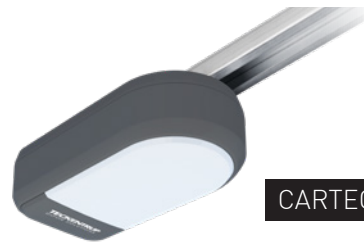
CARTECK MOTOR L75

The CarTeck MOTOR L60 can lift doors up to 123kg. Included as standard are 2 x 4-channel remote transmitters. It is compatible with all accessories - see reverse.