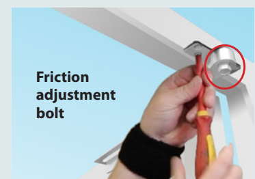
Friction adjustment bolt

The friction of the stay can be adjusted by tightening or loosening the bolt with an adjustable spanner.