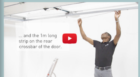
... and the 1m long strip on the rear crossbar of the door.